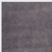
Flow - Dark Grey